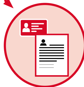
Membership of our on-campus Employability Hub and careers support

to help you with your CV, job and UCAS applications and finding higher level courses and employment.