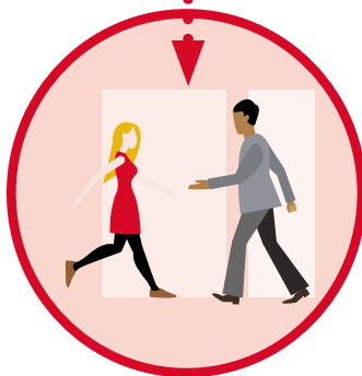
A work placement with a relevant company

including industry-led projects, national competitions or the Duke of Edinburgh award