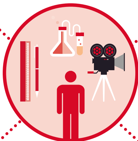
Your vocational course