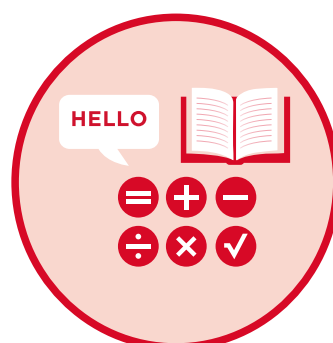
English and maths lessons

unless you already have GCSE at grade 4 or above in these subjects